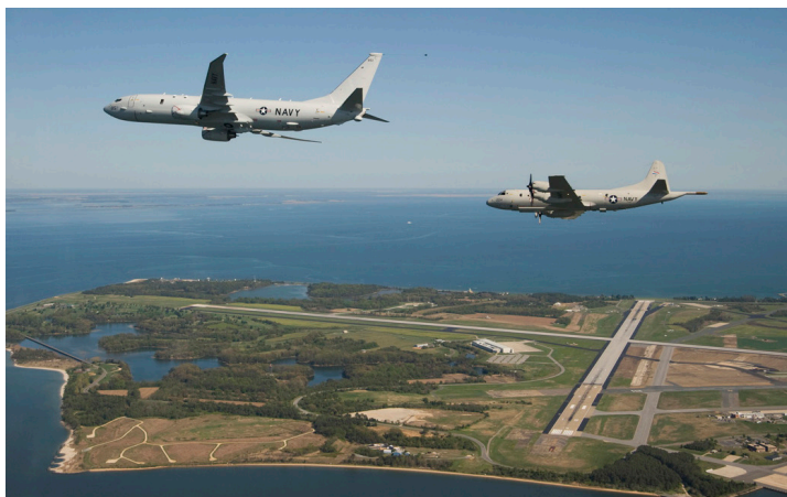
P-8A arrival to Naval Air Station Patuxent River.

To learn more about this year's nine REPI Challenge funding recipients, explore the 2022 REPI Challenge Package for additional information on project highlights, partnerships, and funding information. For more information about the REPI program and supportive DoD efforts, please visit www.repi.mil .