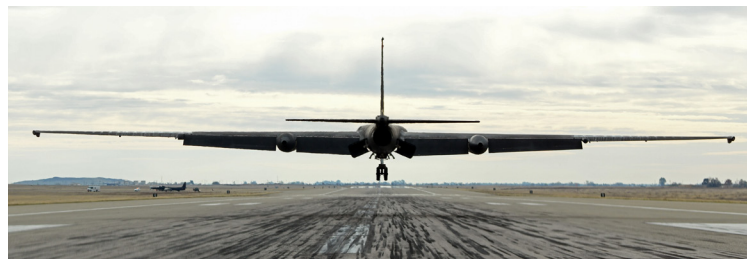
A U-2 Dragon Lady assigned to the 9th Reconnaissance Wing prepares to land at Beale Air Force, Calif.

This year, the 2022 REPI Challenge will provide $31.6 million in program funds to be coupled with more than $60.3 million in partner contributions. These funds will help implement nine projects that limit incompatible development, enhance military installation resilience, and protect local habitats to preserve and improve key mission capabilities. By spreading funding across nine projects , the REPI Challenge will contribute to initiatives benefiting 13 installations and their neighboring communities. Three of the selected projects are located within sentinel landscapes and will contribute directly to the strategic goals of the Sentinel Landscapes Partnership .